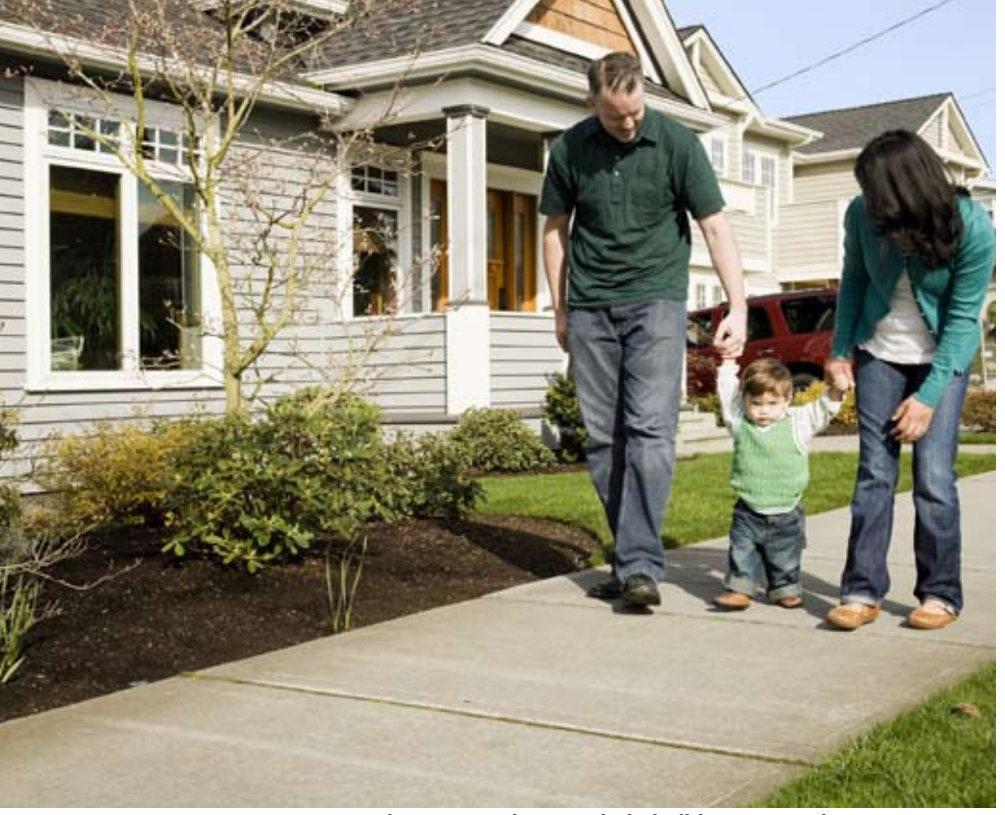
USEFUL INDICATORS Comparing census data can help build a community or neighborhood assessment model